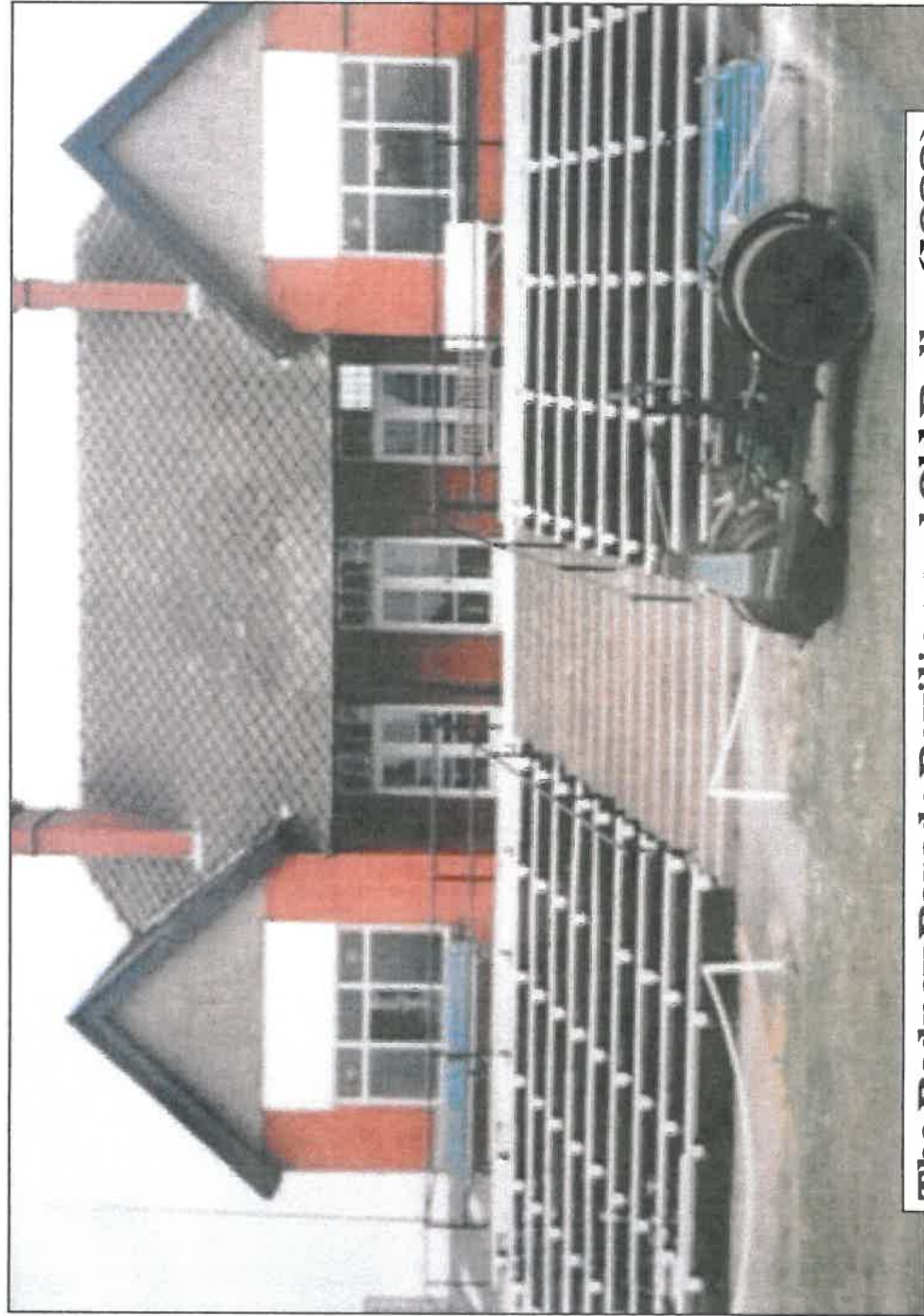
The Rodney Parade Pavilion and Old Roller (1988)