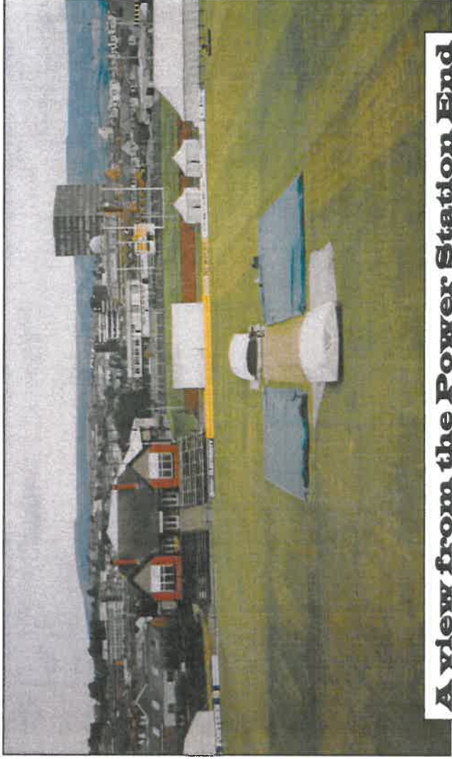
A view from the Power Station End