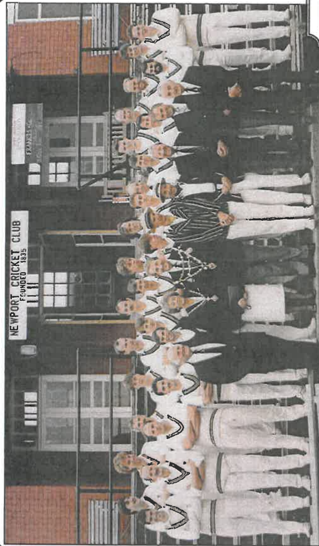
The Newport and Cardiff Teams