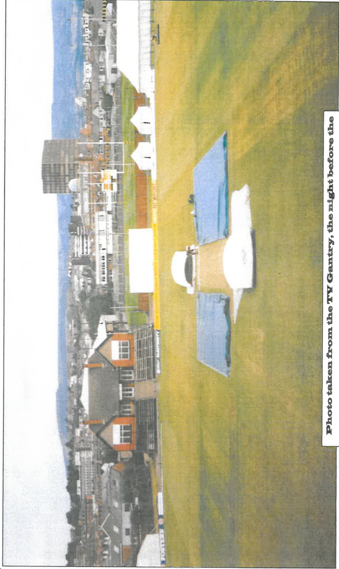
Photo taken from the TY Gantry, the night before the Glamorgan v Yorkshire match (24th June, 1990)