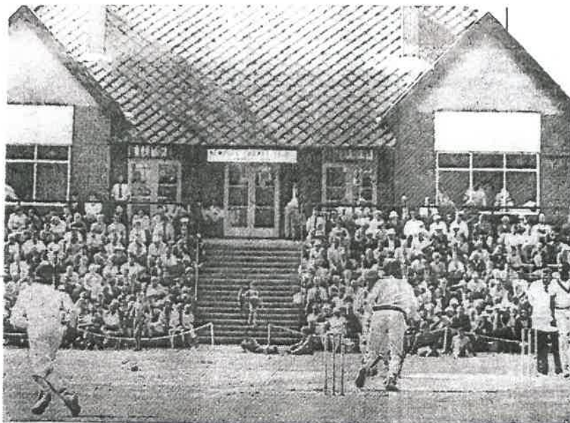
● Newport cricket ground, where the bulldozers could be digging up the cricket square before long.

The decade starts in disaster! After 97 years the Club loses its spiritual home, as the Rodney Parade Cricket Ground is sold