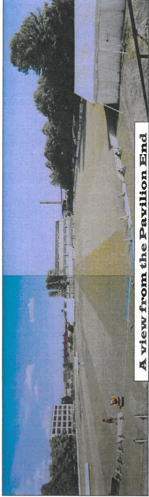
A view from the Pavilion End

'The Gods are shedding one final tear for the ground'.