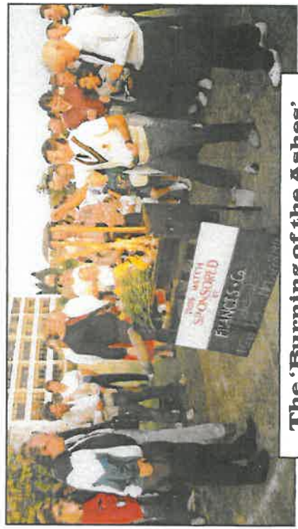
The 'Burning of the Ashes'